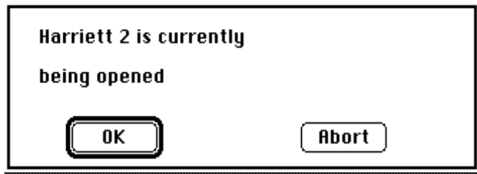
Figure 4.5 Connection Status Dialog Box