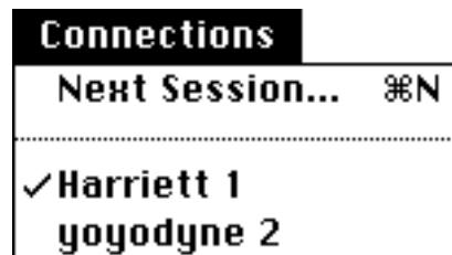
Figure 4.3 Connections Menu

To activate the next session, select Next Session from the Connections menu. If you are using command key mode, you can activate the next session on your desktop by pressing ⌘-N (for next). Doing so activates the session window directly beneath the current session window.