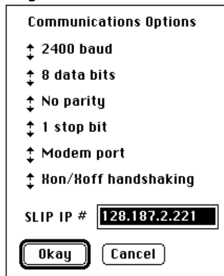
Figure 4.9 Serial Settings Dialog Box

To use the serial port, you must configure it for proper use. To do this, select the "Serial Port Setting" menu item from the Network menu. After doing that, you should see the Serial Settings dialog box, as in Figure 4.9.